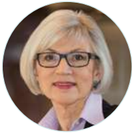
The Right Honourable Beverley McLachlin 2020 Mentor